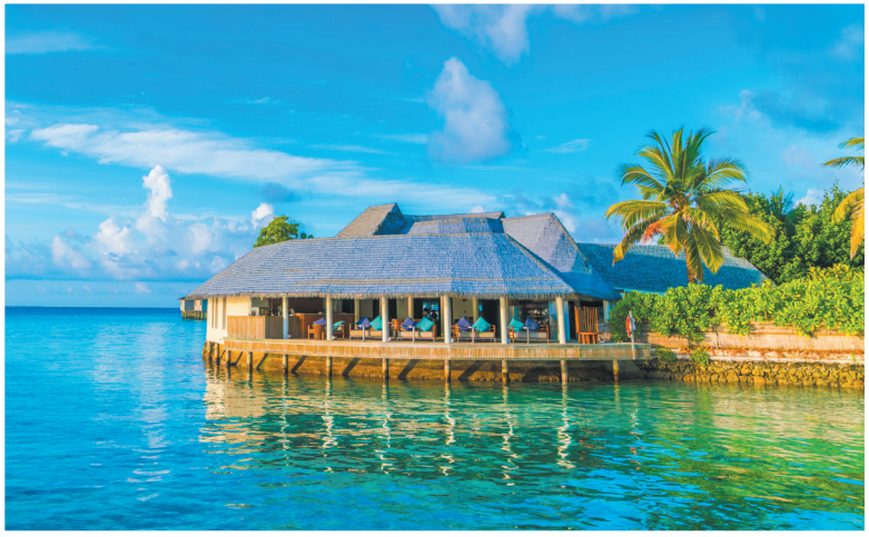
Under the sea

If you are a watersports fanatic then take the plunge as the Maldives is 99% water!