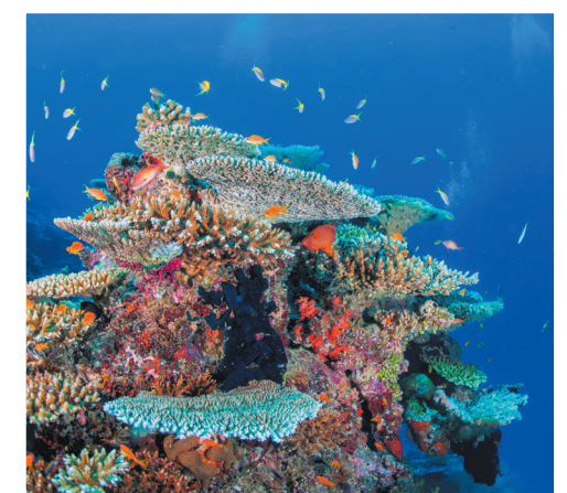
Did you know? The first underwater cabinet meeting was held in the Maldives